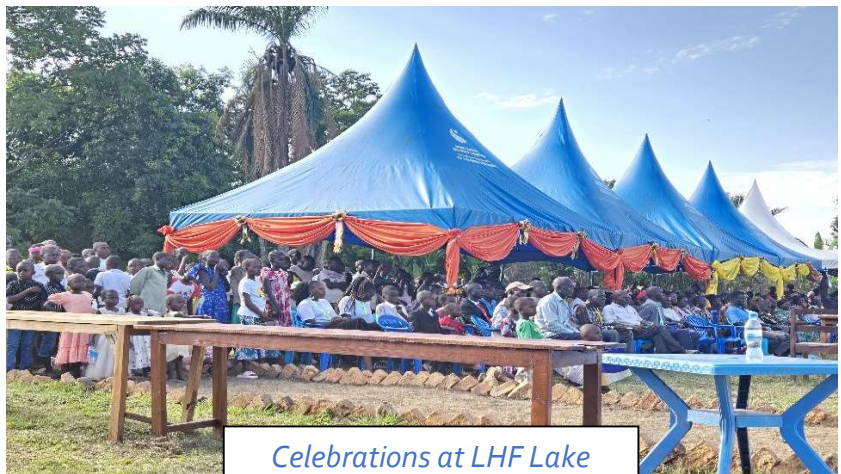
Celebrations at LHF Lake View Gardens April 20, 2025

the inauguration of the splendid St. Paul's Cathedral, the first ELCSS/S completed permanent church building! In attendance was the Acting Governor of Western Equatoria State, H.E Daniel Badagbu Rimbaso, other government dignitaries, representatives of the Azande Kingdom, international church partners and local sister churches among others.