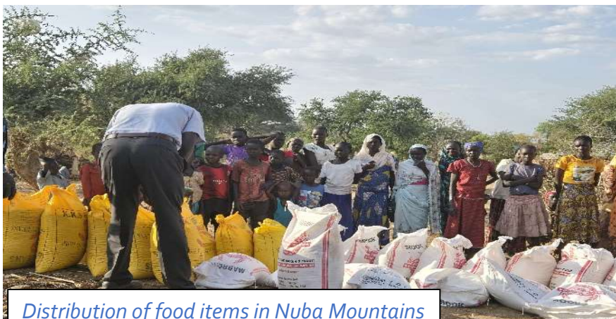
Distribution of food items in Nuba Mountains

While distributing relief in Nuba Mountains, the newly translated Otoro Simple Explanation of Christianity by LHF was distributed at the same time. No single book was left, all were given out in one day! The people are not only hungry for food, they are also hungry for the Word!